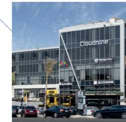
Cloud Nine Mall Tinted Euro Grey