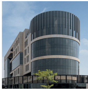
Raya connection Solarlite Euro Grey

El-Masa Hotel New Capital Vistalite Euro Grey