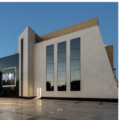
The Spot mall New Cairo Vistalite Euro-Grey

All of Sphinx Glass grey range is subtly (and aesthetically) transparent, strikingly reflective and versatile (easily processed). It lets the light in with solar energy control and can be bent or cut into almost any shape. So, when it comes to design and architecture, the possibilities are endless as well as remarkable.