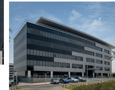
CFC Admin Building tinted Euro Grey

Sphinx Glass is a partner in success after cooperating with rmc (raafat miller consulting) that has been providing architectural and engineering services to CFC (Cairo Festival City, Al-Futtain Group Real Estate development in New Cairo) for their Southern Business Park District, a landmark in the 5th Settlement. The design of the architectural buildings was in line with one of the trends of architectural designs. The glass used in glazing applications was supposed to be provided with certain standards. Therefore, Sphinx Glass was chosen for their superior grey glass selection. Three office buildings were built in 2014 and five more in 2017 and presently, there are eight buildings being constructed using Sphinx Glass grey selection.