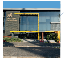
Hany Saad Innovations Vistalite Euro Grey

Sphinx Glass has just acquired a new ISO 50001:2011 for Energy Management Systems, which specifies requirements for establishing, implementing, maintaining and improving an energy management system, whose purpose is to enable an organization to improve energy efficiency and reduce energy costs, thus saving money as well as helping to conserve resources and tackle climate change.